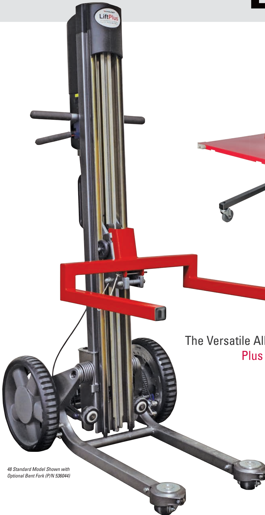
48 Standard Model Shown with Optional Bent Fork (P/N 536044)