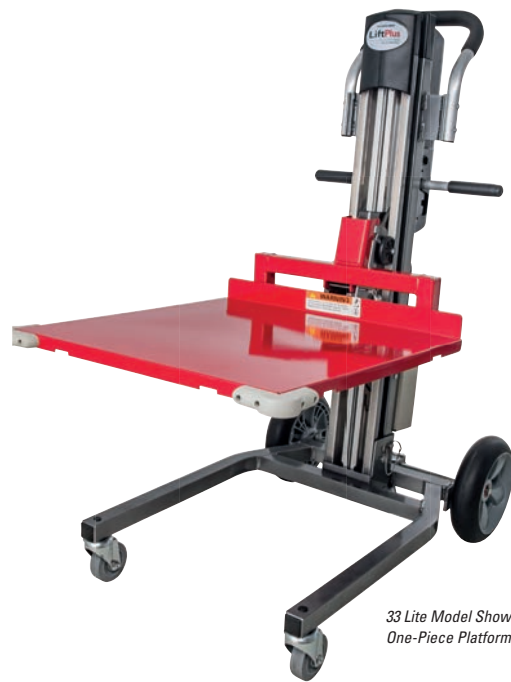
33 Lite Model Shown with Optional One-Piece Platform (P/N 536130)

The Versatile All-In-One System That Lifts... Plus So Much More!